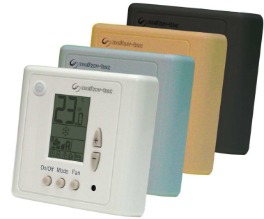
white silver black gold others